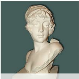
Turban lady bust 32cm £36.00