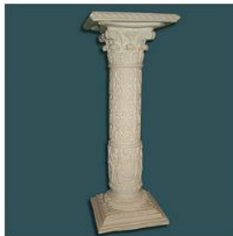
Decorative Pedestal 06 £75.00