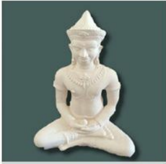
Budha bust 66cm £95.00