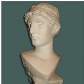
Large man bust 50cm £54.00