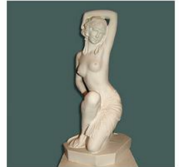
Art deco lady bust 37cm £38.00