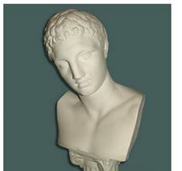
Very large man bust 55cm £60.00