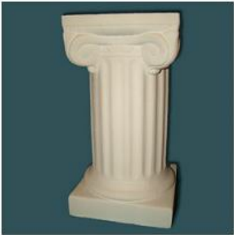
Small Dumpy Pedestal £20.00