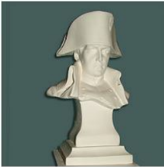
Nelson bust 37cm £36.00