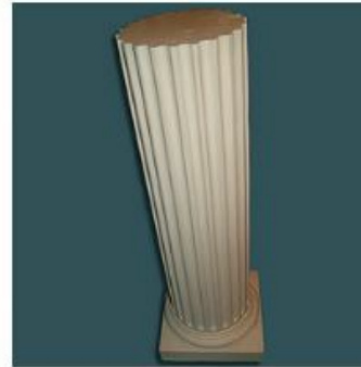
Fluted no top Pedestal £75.00