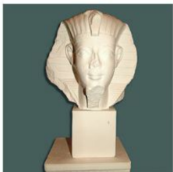
King tut bust 32cm £36.00