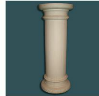
Plain round Pedestal £60.00