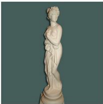
Tall lady bust 63cm £38.00