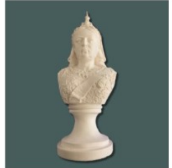
Busts VICTORIA BUST 40CM £36.00 Excluding VAT