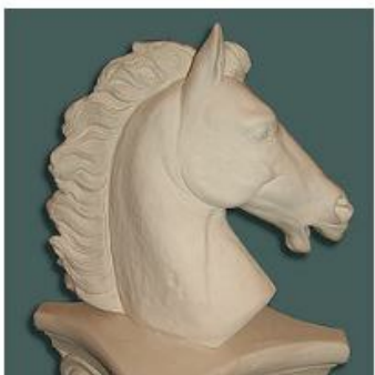
Horse head bust 40cm £60.00