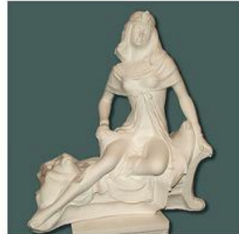
Egyption lady bust 40cm £36.00