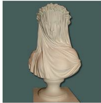
Veil lady bust 36cm £36.00