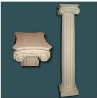
Slim Tall Fluted Pedestal £60.00