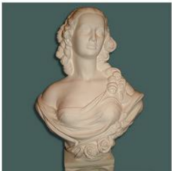
Large lady bust 56cm £54.00