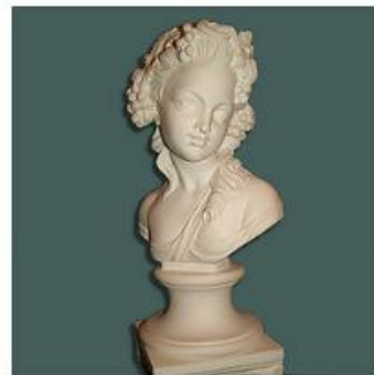
Grape lady bust 45cm £45.00