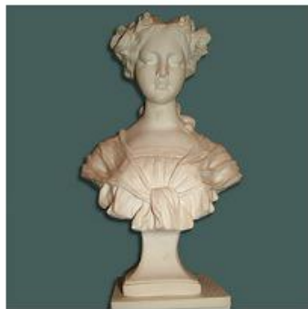
Large classic lady bust 47cm £44.00