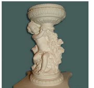
Cherubs bowl bust 39cm £36.00