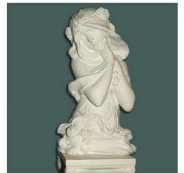
Large flower lady bust 40cm £44.00