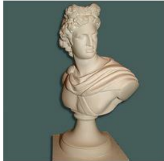
Apollo bust 36cm £36.00