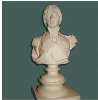
Nepoleon bust 34cm £36.00