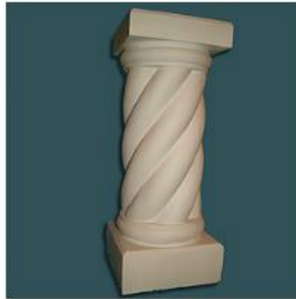
Twisted Pedestal £90.00